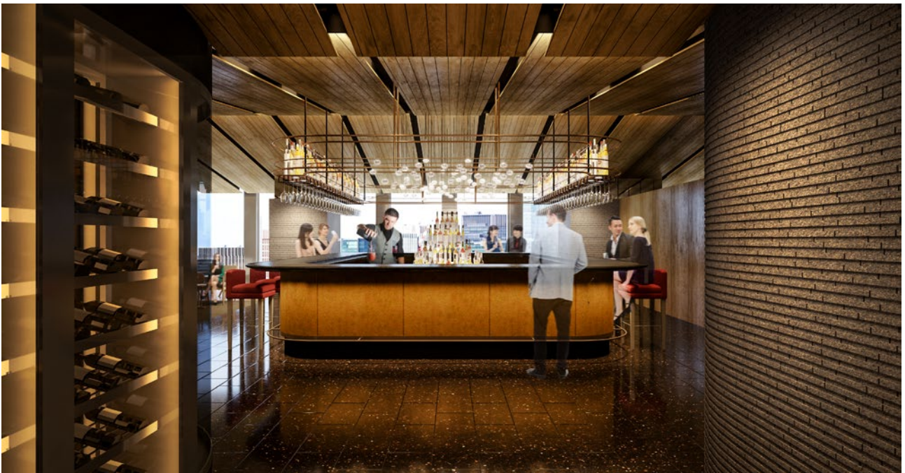
Nihonbashi Club architectural renderings (clockwise from top left): entrance leading to lobby; fitness center; bar

Located on the sixth floor of Nihonbashi Muromachi Mitsui Tower, the Club will feature a fully equipped fitness center (about half the size of the Azabudai Club’s dedicated space), with all the necessary machines and amenities for a cardio workout and weight and cross training.